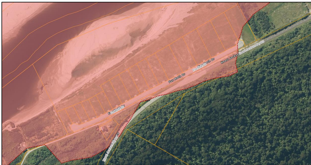
Figure 2 Coastal Hazards Variation Layer - ‘Severe’ mapping layer (red) (TTPP)