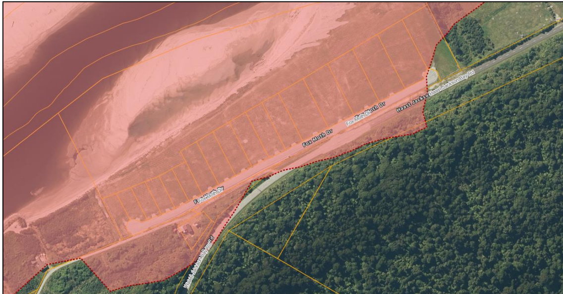
Figure 2 Coastal Hazards Variation Layer - ‘Severe’ mapping layer (red) (TTPP)