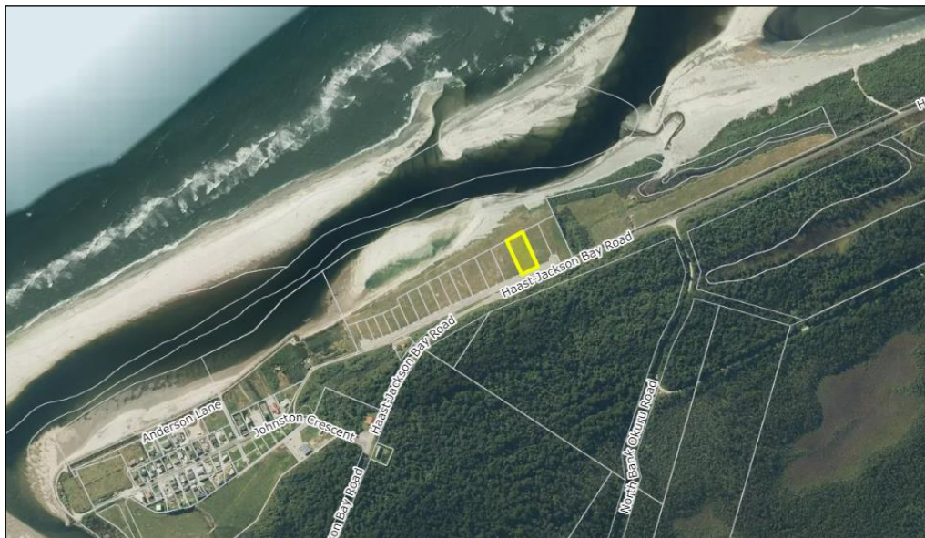
Figure 1 Location of the property that the Submitters have an interest in, indicated by yellow outline (Grip Maps).