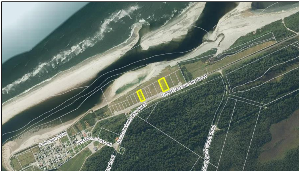
Figure 1 Location of the properties that the Submitter has an interest in, indicated by yellow outline (Grip Maps).