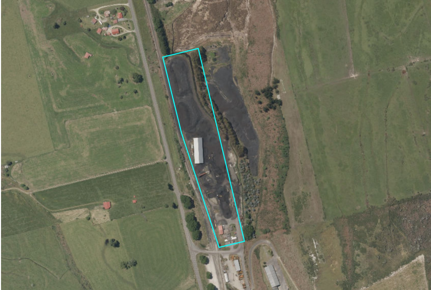
Figure 1: ACML 37160-01