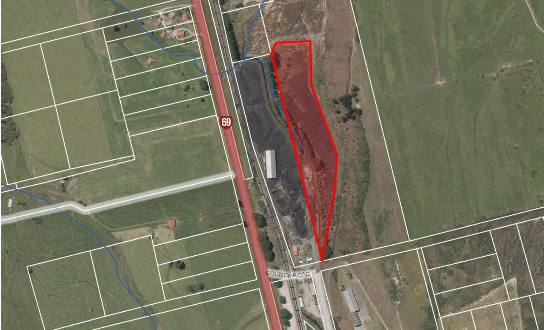
Figure 1: Lot 1 DP 16208.