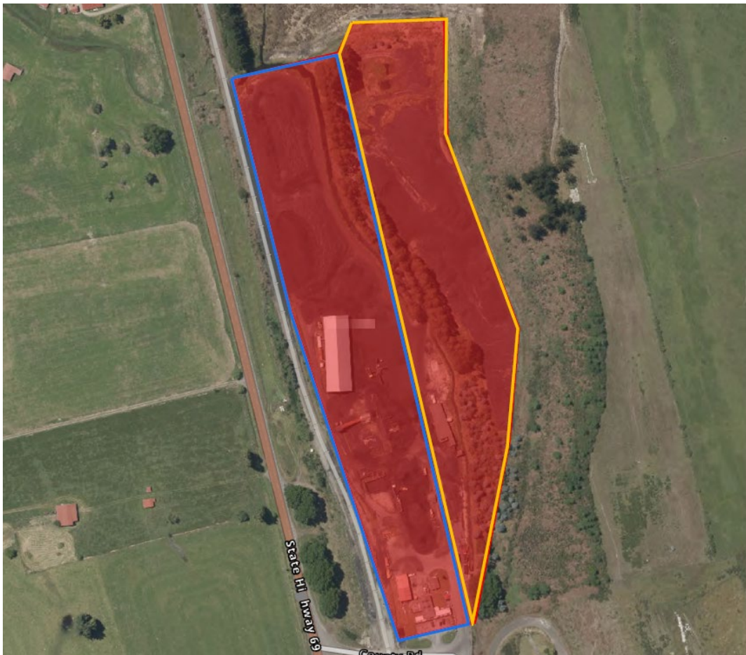
Figure 2: Map of Authorised Mining Activities in relation to MINZ. The full map at Appendix 4.

Based on an assessment of the available information, RC960136 and ACML 37160-01 confirm that the full extent of the notified MINZ at the Reefton Distribution Centre has authorisation to operate a mining activity ( Figure 2 below). A full copy of the map depicting the sites with authorisation to operate a mining activity in relation to MINZ at the Reefton Distribution Centre is provided at Appendix 4 .