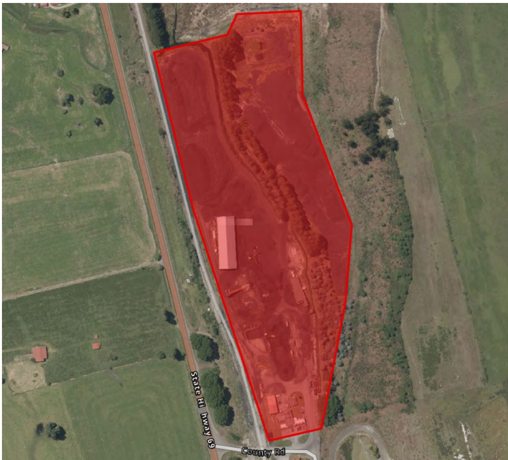
Figure 1: Notified MINZ at Reefton Distribution Centre.

A map of the notified Mineral Extraction Zone (MINZ) at Reefton Distribution Centre is included in Figure 1 below and attached in Appendix 1 .