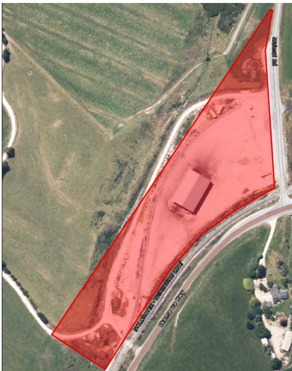
Figure 1: Notified MINZ at Mai Mai Siding.

A map of the notified Mineral Extraction Zone (MINZ) at Mai Mai Siding is included in Figure 1 below and attached in Appendix 1 .