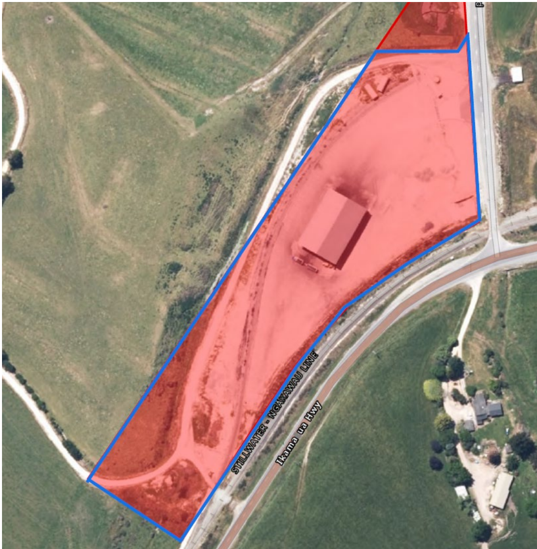
Figure 2: Map of Authorised Mining Activities in Relation to MINZ. The full map at Appendix 3.