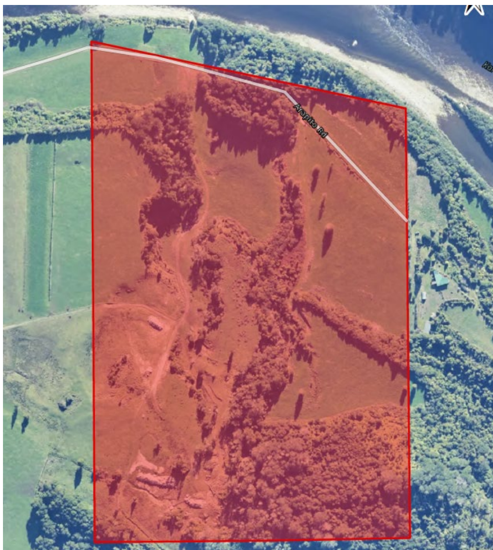
Figure 1: Notified MINZ at Karamea Quarry.

A map of the notified Mineral Extraction Zone (MINZ) at Karamea Quarry is included in Figure 1 below and attached in Appendix 1 .