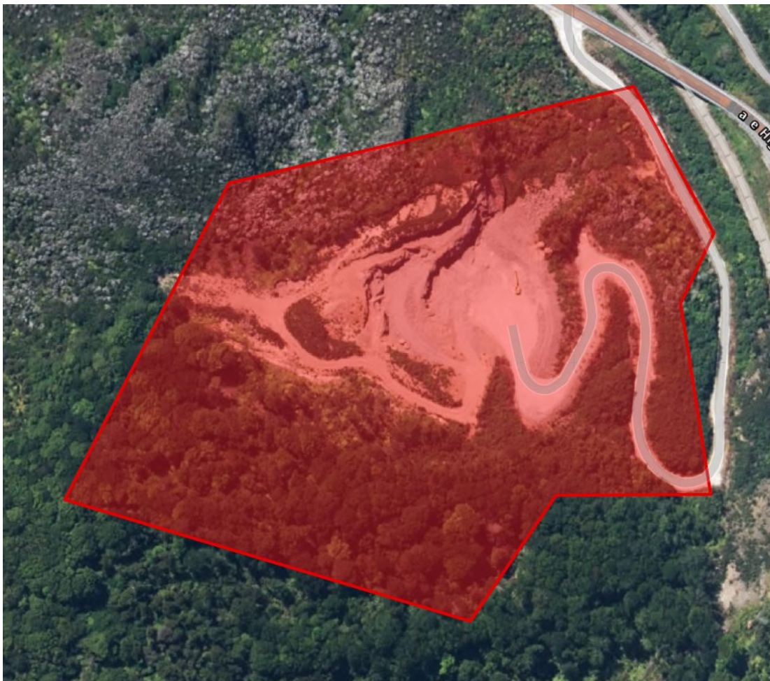
Figure 1: Notified MINZ at Kiwi Quarry.

A map of the notified Mineral Extraction Zone (MINZ) at Kiwi Quarry is included in Figure 1 below and attached in Appendix 1 .