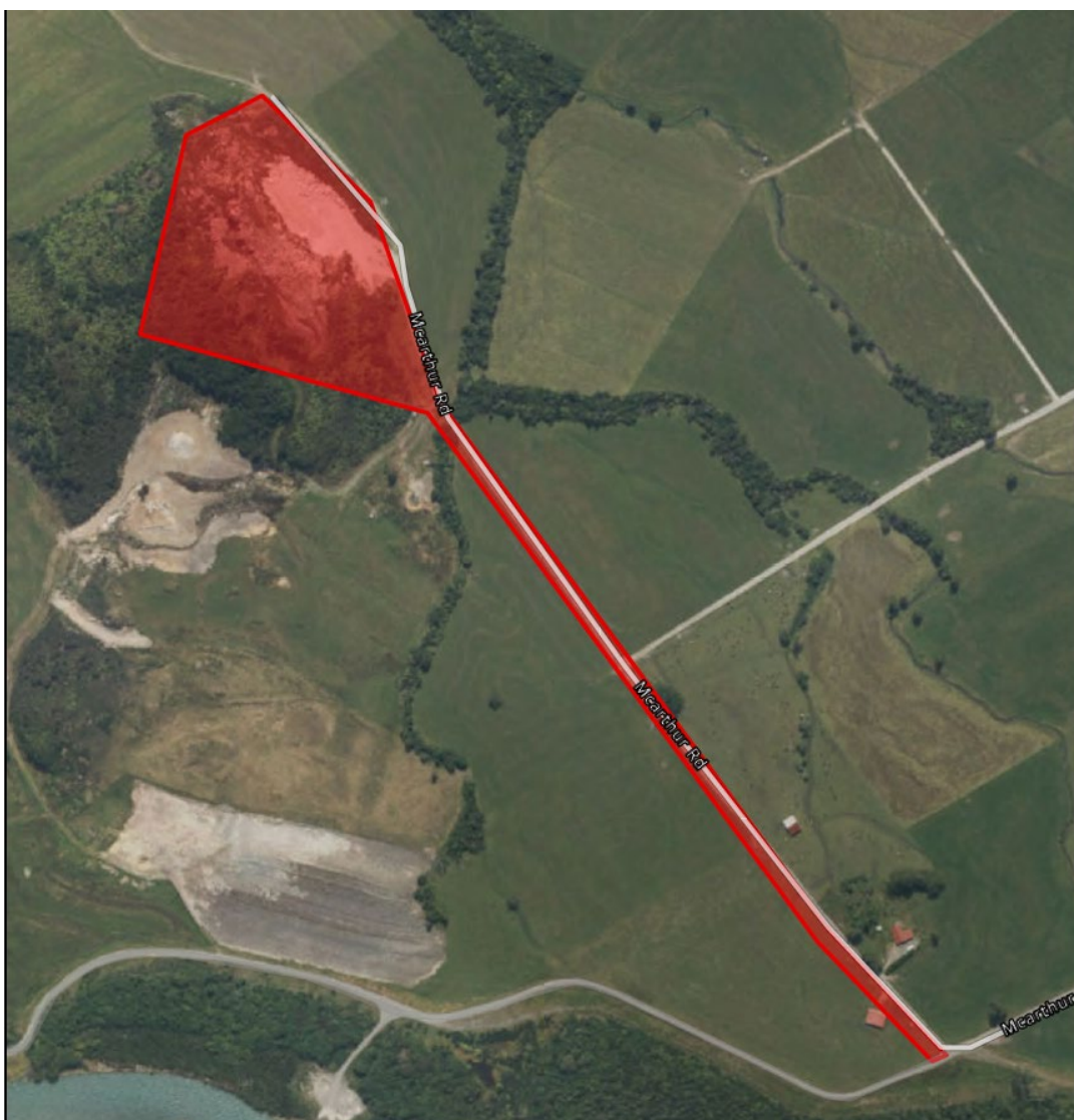
Figure 1: Notified MINZ at Inchbonnie Quarry.

A map of the notified Mineral Extraction Zone (MINZ) at Inchbonnie Quarry is included in Figure 1 below and attached in Appendix 1 .