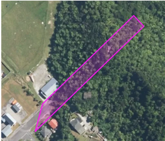
Extent of setting.