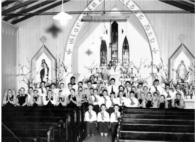
c. 1963 confirmation service at St Patrick's. West Coast Recollect.

Cyclopedia of New Zealand – Nelson, Marlborough & Westland Provincial Districts Christchurch, 1906, p. 539.