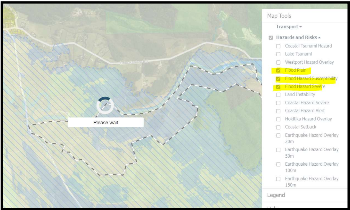
Figure 3 - The above is from the TTPP mapping programme with part of the site outlined in black & white line. The three Hazards and Risk layer are highlighted.

Also, extremely disappointing for my client is that your TTPP Mapping Programme does not enable this allotment to register with your programme – when the allotment is clicked on, the “Please wait” symbol just sits there. I do not think that this is a good thing, when people are trying to access the TTPP Mapping Programme to see what is proposed for their land.